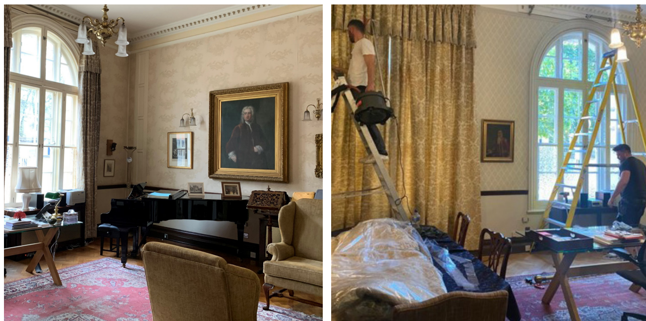
BEFORE: Principals Office