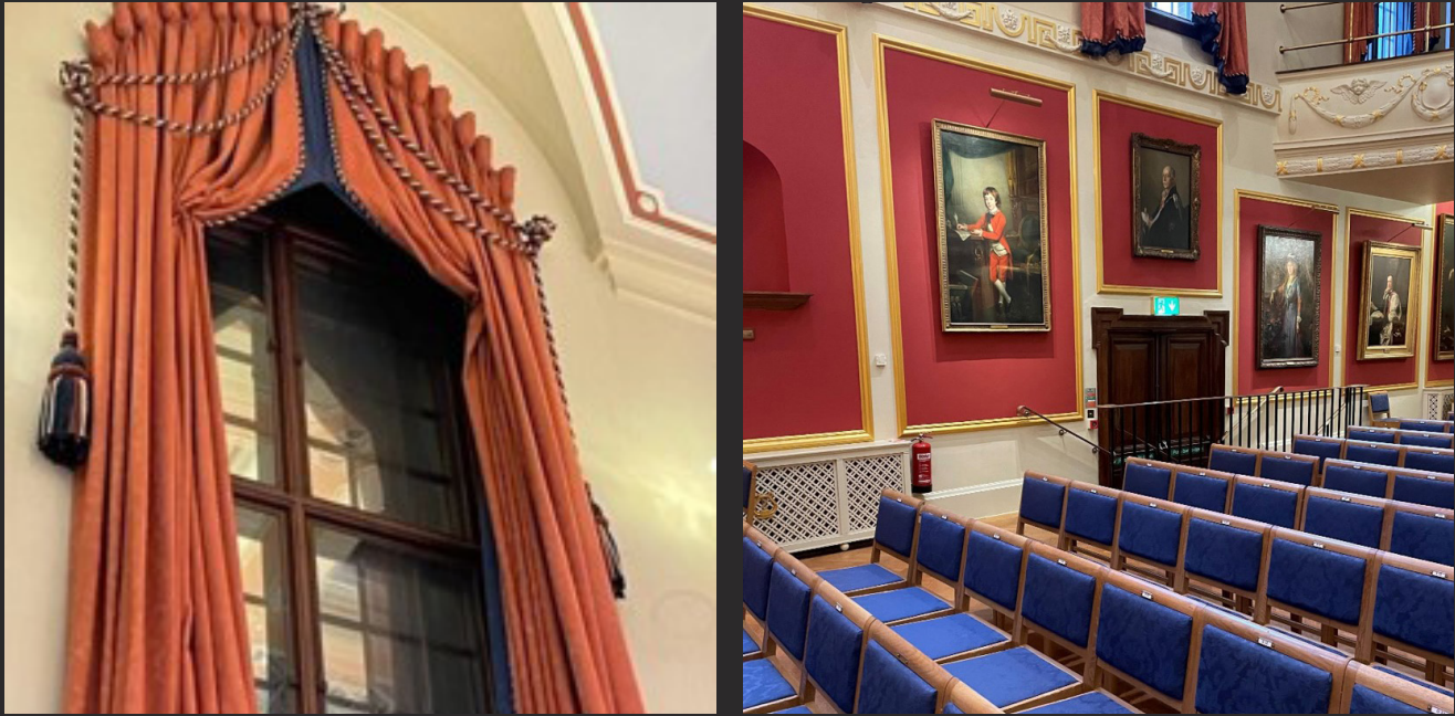
AFTER: Dukes Hall